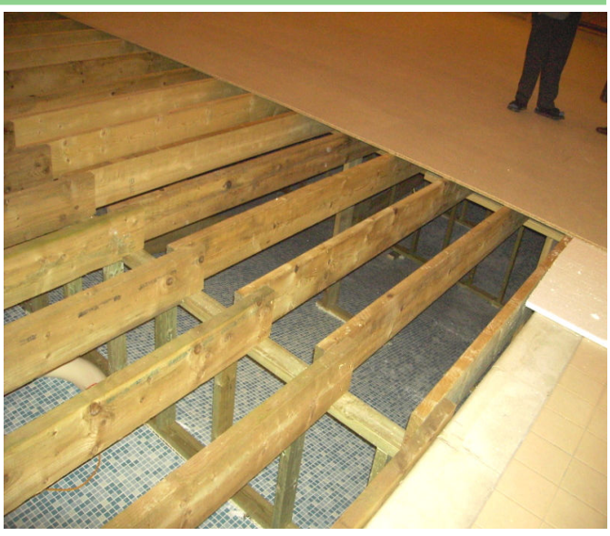
Make sure everyone is accounted for before the swimming pool gets covered