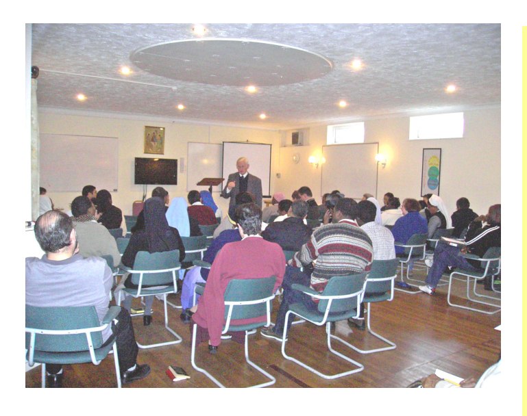
The Lecture Hall