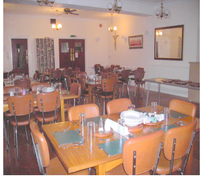
The Dining Hall