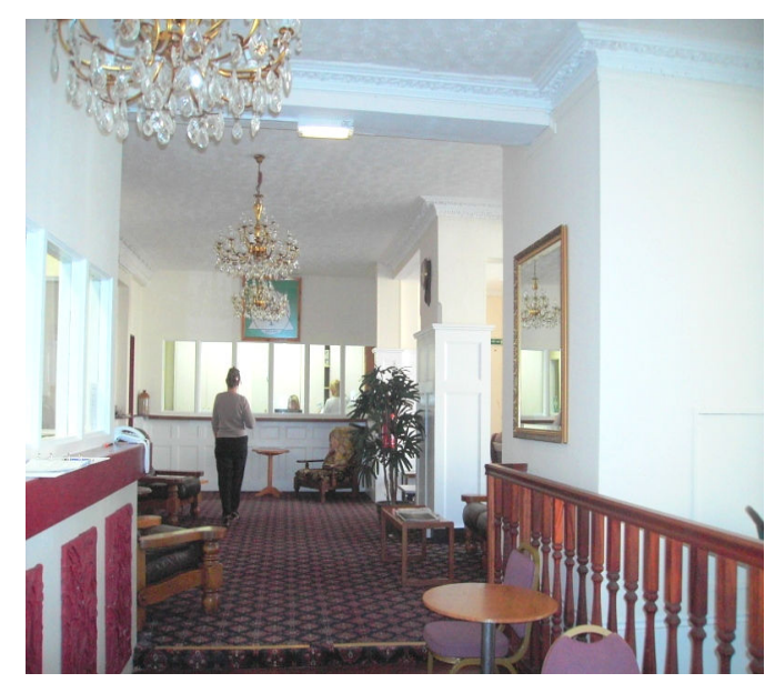
The reception area gets a makeover