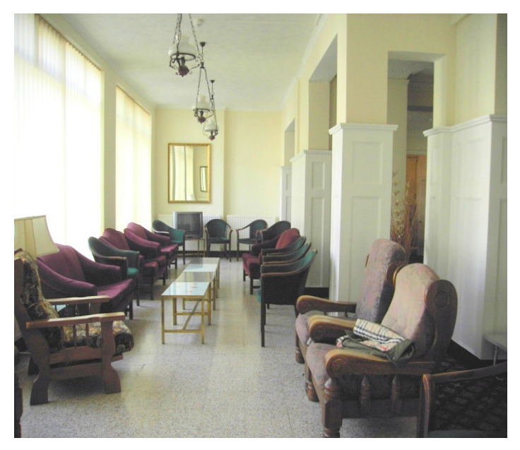
Seating area in the reception