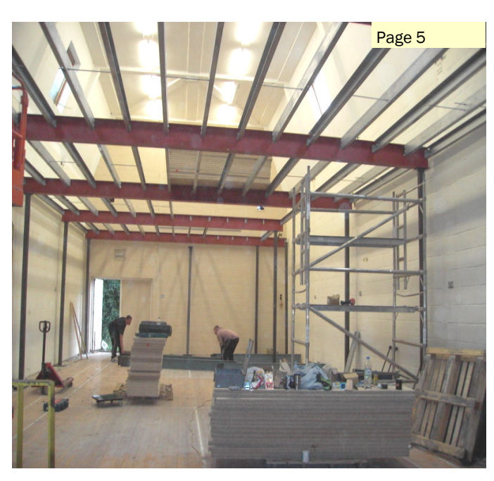
Conversion of the lodge to provide 7 new offices and EQ therapy hall