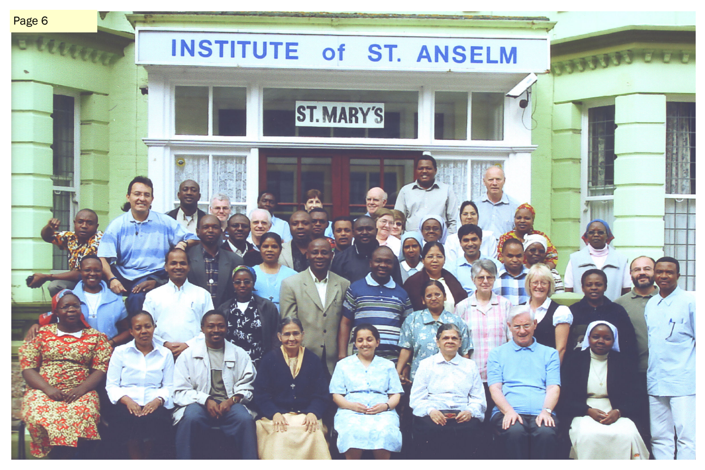
The Summer Course Group 2008