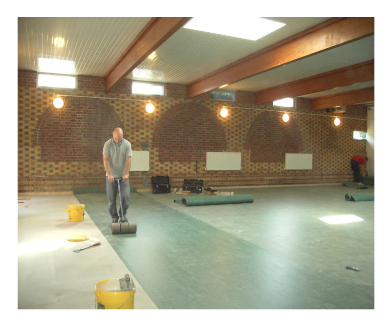
The finished floor goes down over the swimming pool