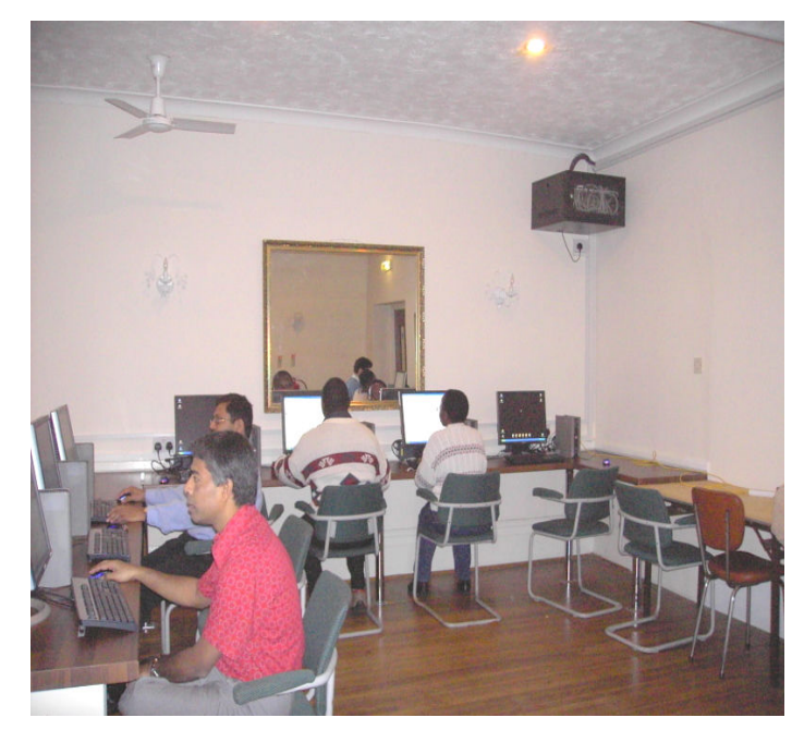
New Computer suite for the use of the students