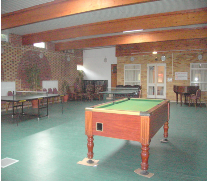
Now it's a very large recreation room for the students